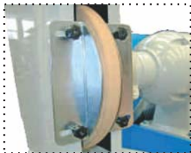
Adjustable wheel guard