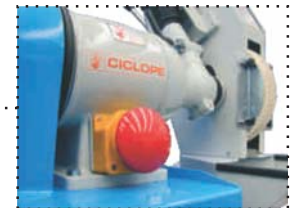
Motor PLA 250/2