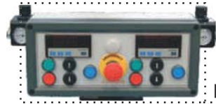
Push-button control panel